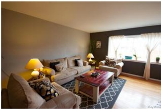
Inviting and cozy living room.