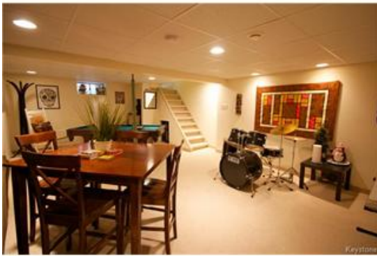
Large rec room area