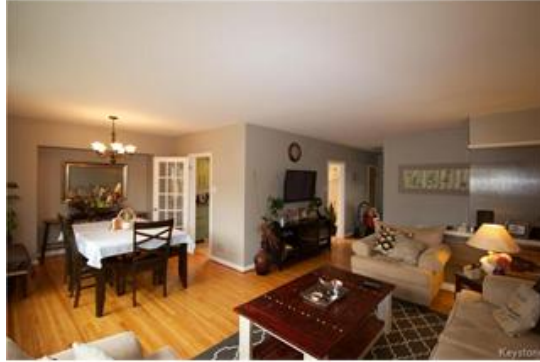
Open concept living and dining area with plenty of natural light.