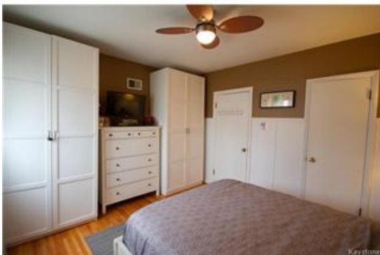
Plenty of storage in this master bedroom with the included wardrobe closets.