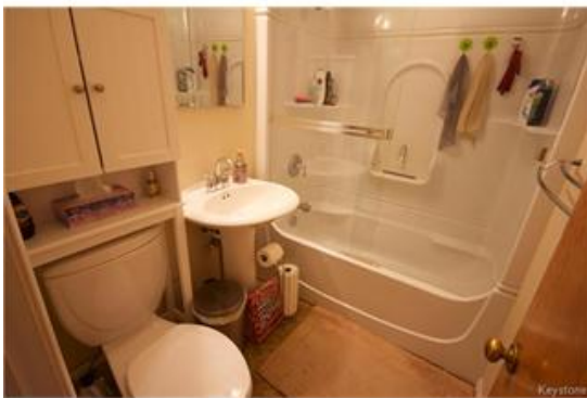
Main floor 4 piece bathroom with granite tile floor.