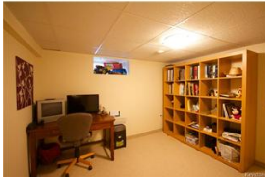
Office/den/4th bedroom in basement.