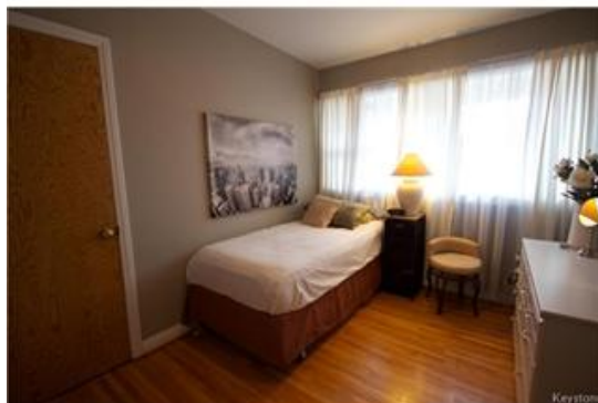
Cozy 3rd bedroom.