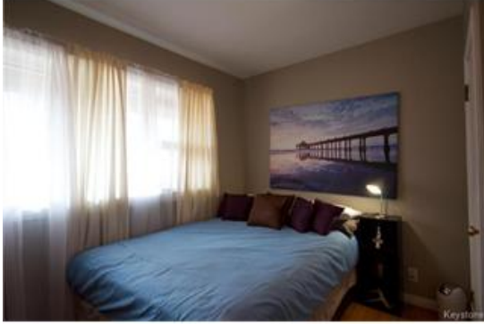
Warm second bedroom.