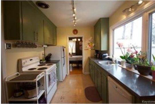
Modern kitchen with updated hardware and counter.