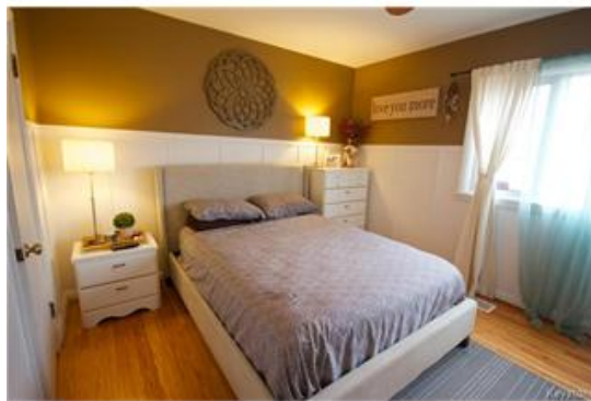
Tastefully designed master bedroom with wainscoting and ceiling fan.