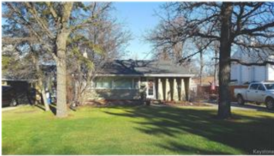
A quiet street, surrounded by mature trees.