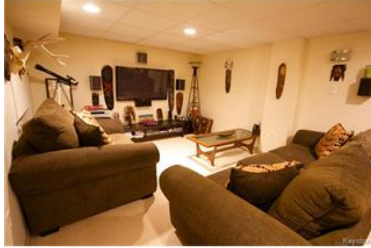
Movie entertainment area in basement with lights on dimmers and wired in